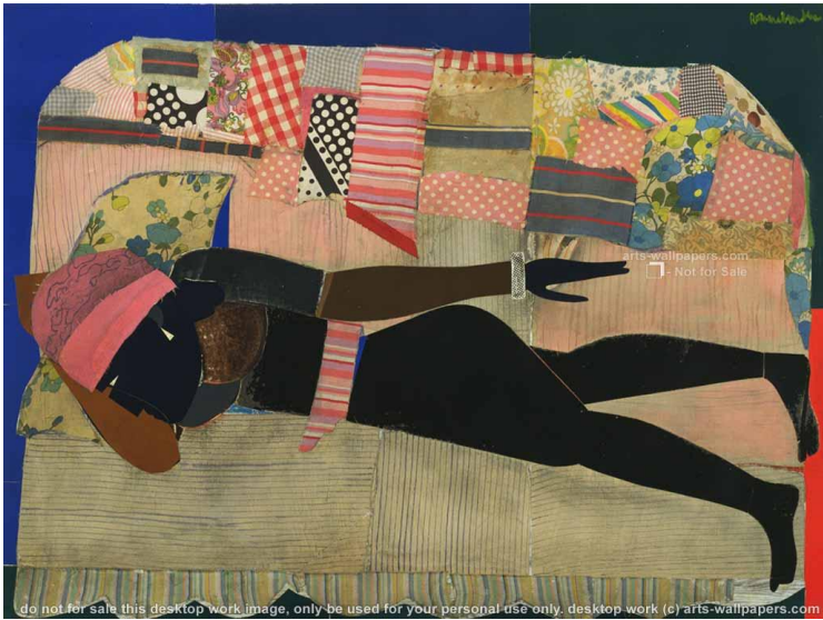
do not for sale this desktop work image, only be used for your personal use only. desktop work